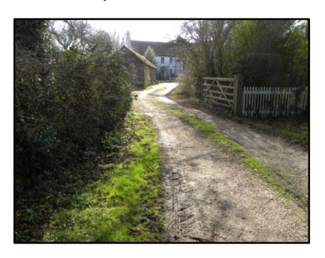
Park Farm – the original building dates from around 1600.