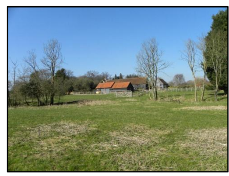
Bury Farm – the high-speed line would pass about 50 metres to the left of this picture.

The imprint of the main farm buildings adjoining the house appears on a map prior to the Enclosure Act. The farm field adjacent to Potter Row lane contains the ditch which marked the boundary of common land before the Enclosure Act.