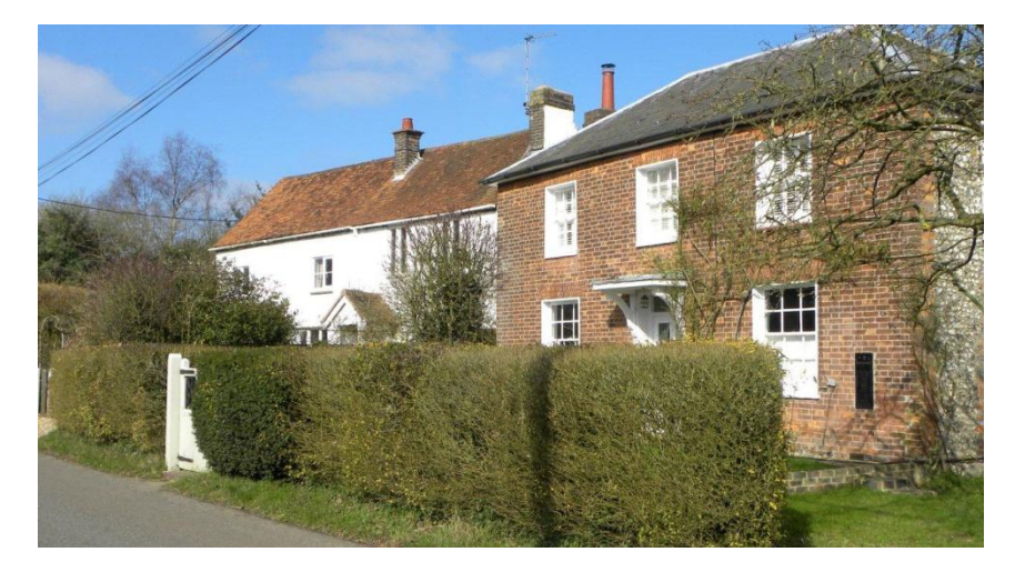
Two houses on the north side of Potter Row. That on the right is Lamb House, formerly The Lamb public house - and popularly known as 'The Bleeding Lamb'.