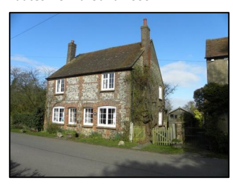
Beeway Cottage – a typical brick-andflint labourer's cottage built with materials taken direct from the fields.